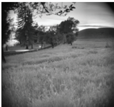
High Dynamic Range Imagery (Vignetting from the Lens)

A camera core that includes the ISIE19 sensor on a headboard and a high-voltage power supply is also available. Contact the factory for details.