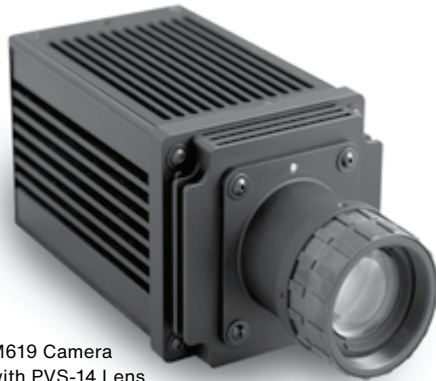
M619 Camera with PVS-14 Lens